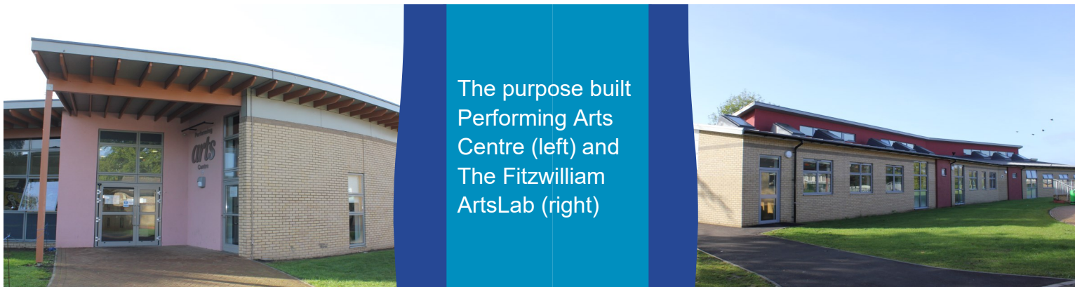
The purpose built Performing Arts Centre (left) and The Fitzwilliam ArtsLab (right)