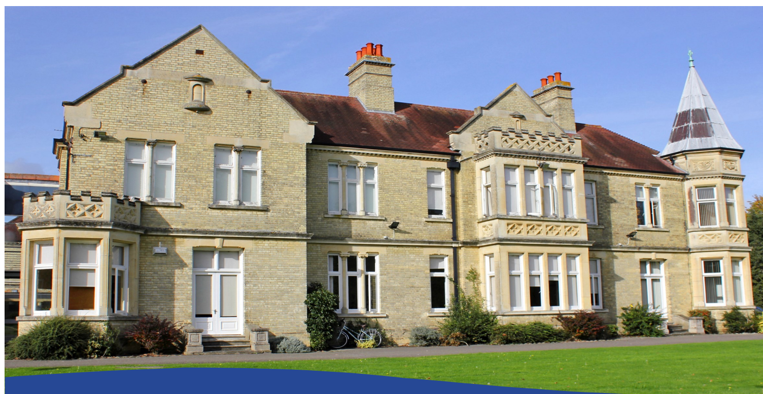
Beechurst - housing the maths and English departments