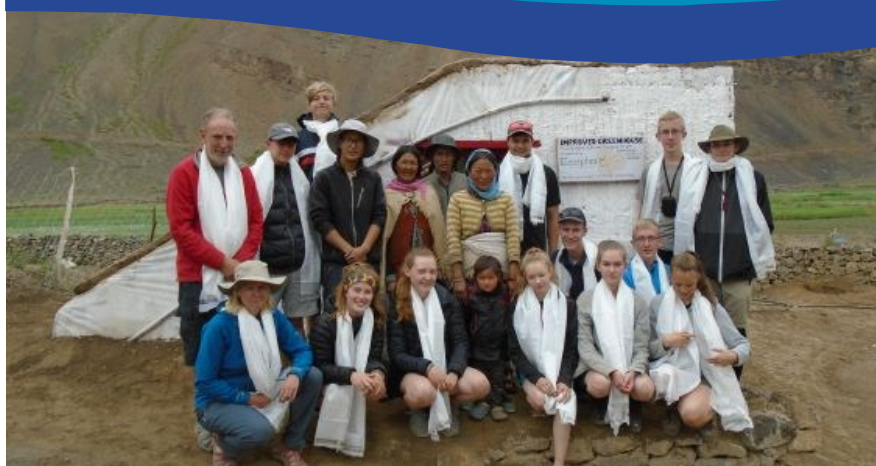
India trip with Year 11 students, July and August 2018

One of the school's special features is a wide and lively range of educational visits and events. Students of all ages are encouraged to participate in as many opportunities as possible. These activities 'beyond the classroom' bring a different aspect to learning: they are enjoyable and stimulating, and often help students to become more independent, sociable and enthusiastic about their learning. In every year, there are opportunities for students to learn outside the classroom, to visit new places and to gain new experiences. There truly is something for everyone!