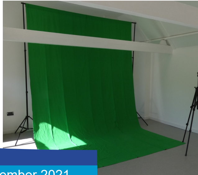
Newly opened in September 2021, The Film and Media Suite