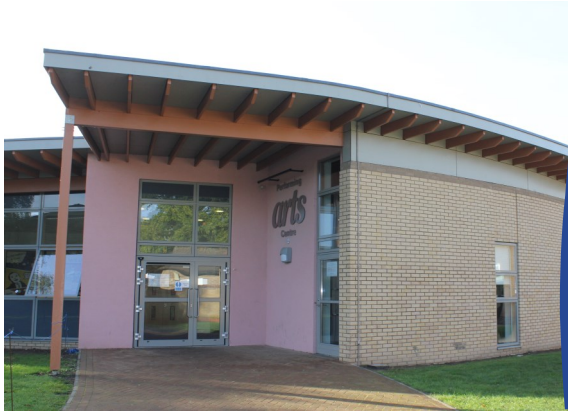
The purpose built Performing Arts Centre (left) and The Fitzwilliam ArtsLab (right)